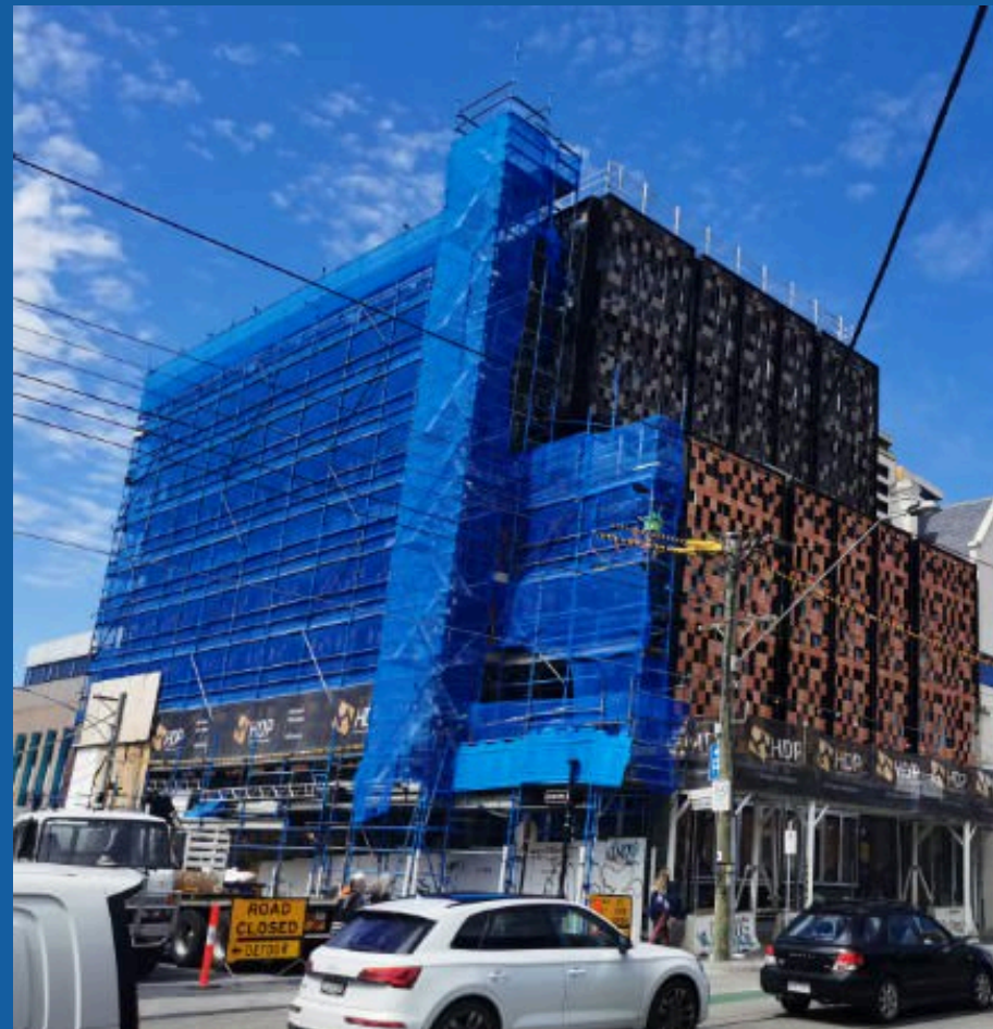
Harris HMC South Yarra